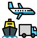
TRANSPORT (RAIL, AVIATION, FERRY)