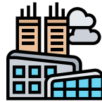
INDUSTRY AND MANUFACTURING